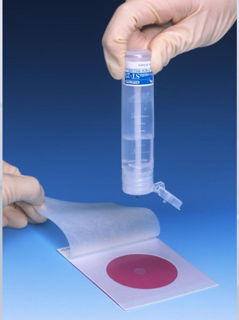
Above medium is 3M Petrifilm