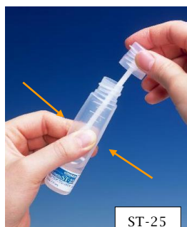
Squeeze swab bud to remove excess diluent.