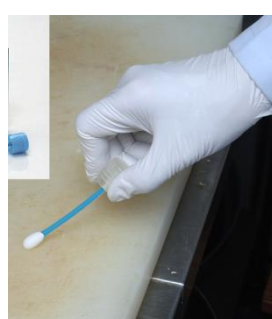
Mix to suspend.